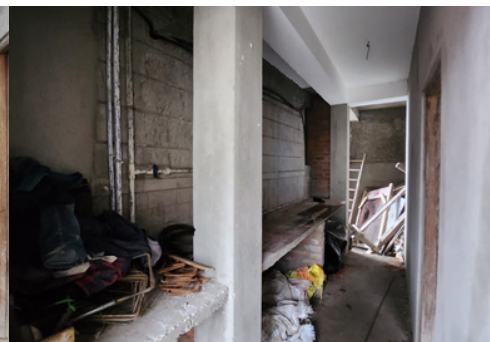
Prep table & storage area