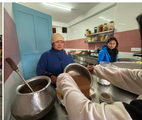
Kitchen open for business