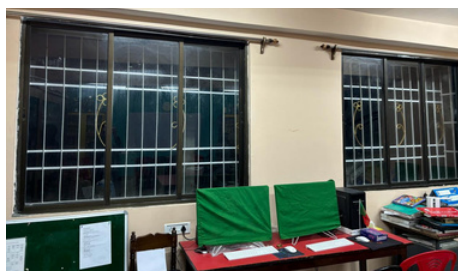
Bars to keep the computers secure