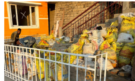
Stairs being made safe