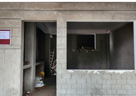
Kitchen shell is ready