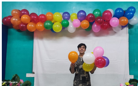
Recreation room opening ceremony