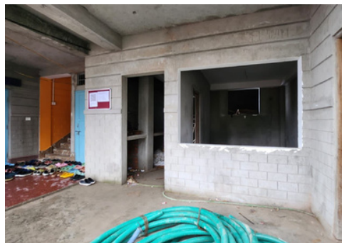
Completion of wiring & fitting gas pipes

One of the most notable enhancements to the kitchen's design was the addition of a window overlooking the dining room. This strategic placement allows for direct communication and interaction between kitchen staff and diners, fostering a sense of connection and accessibility. Moreover, it enables food to be served promptly and efficiently, enhancing the overall dining experience for both children and staff. The cook at KBM, Ms. Rai, has happily reported that the new kitchen is a very comfortable space to work in.