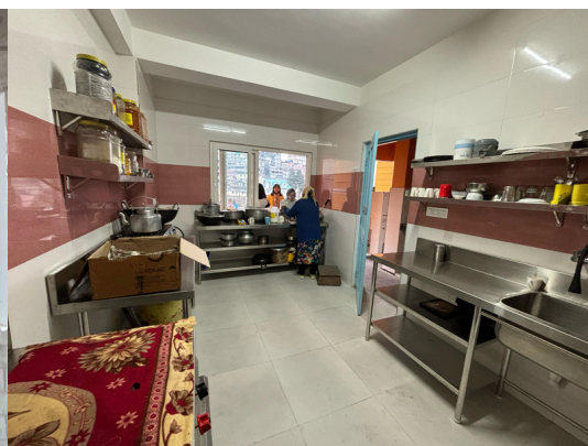
Sleek and modern appliances