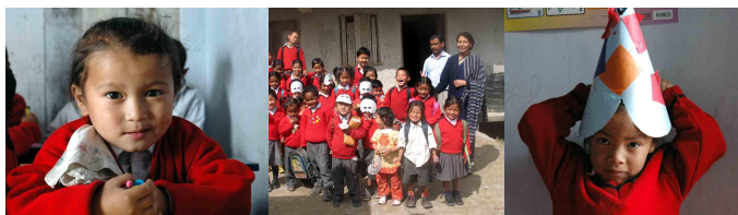
Some of the children who have benefited from your generosity

We are very happy to be able to announce that by December the Trust will have achieved the milestone of having raised £20,000 since it began, a great sum to help the children in Darjeeling. A very big thank you to everyone for helping us do this. None of the Trustees claim expenses and the expenses we have are small, for example they are needed to pay for our web site. These all come out of gift aid - a present from the government!